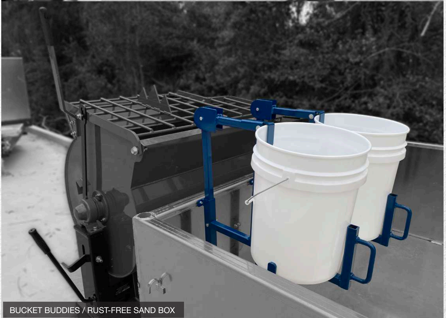
BUCKET BUDDIES / RUST-FREE SAND BOX