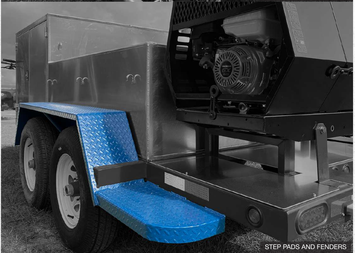
STEP PADS AND FENDERS