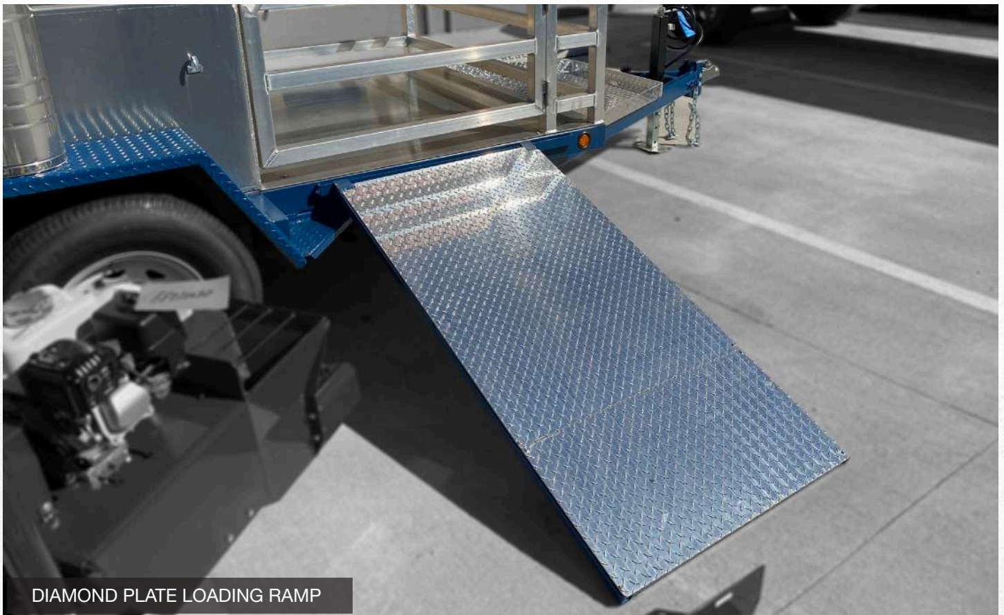
DIAMOND PLATE LOADING RAMP