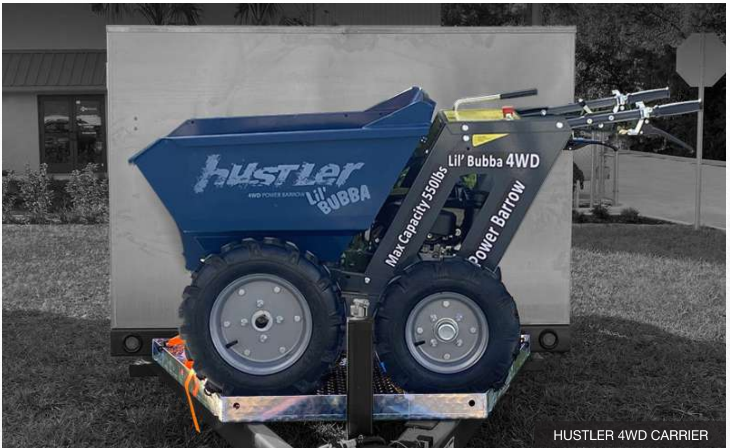
HUSTLER 4WD CARRIER